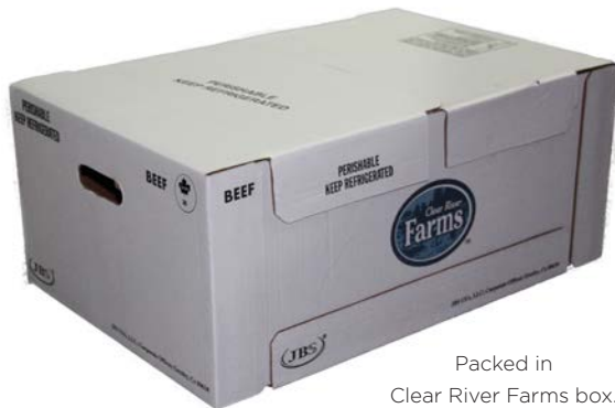
Packed in Clear River Farms box.

*Compared to conventional no-roll programs