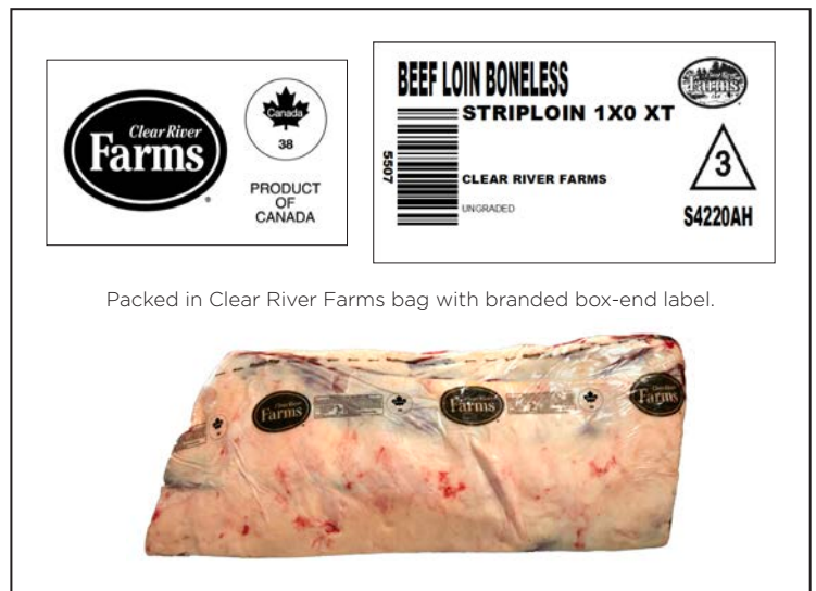
Packed in Clear River Farms bag with branded box-end label.